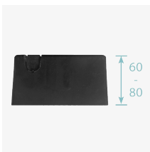
Recessed box included